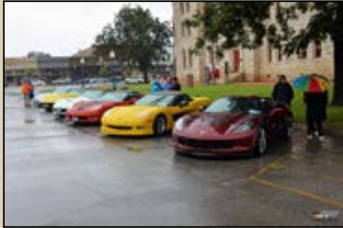
October 13th 2018, Granbury, Texas