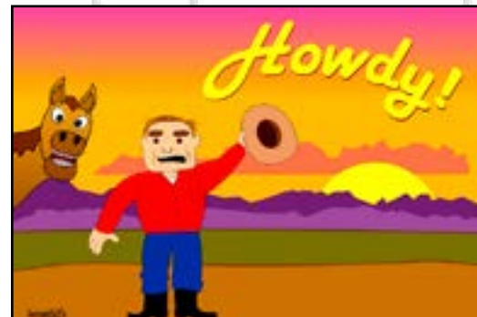
Cover photo - No carbs here.....