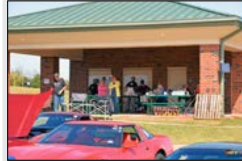
October 20th 2018, Edmond, OK