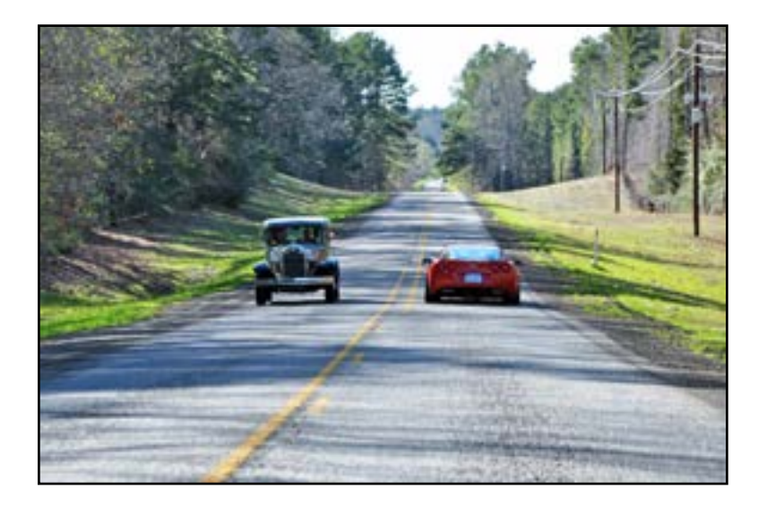
Complete schedule and flyers for these events can be found at <a href="http://www.ncccswregion.org/schedule.html">http://www.ncccswregion.org/schedule.html</a>

On September 30th, the event bids for the 2018 Competition will be submitted - Stay tuned!!