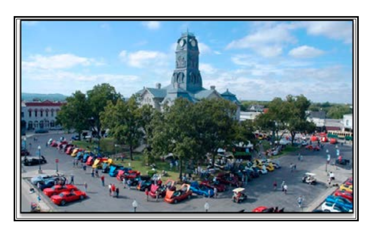
Historic Granbury Square Location of the 2017 BRCC Car Show