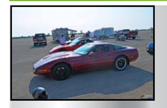
September 2nd 2017 Mineral Wells, TX