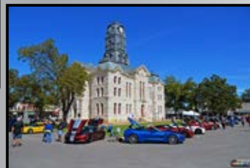
The event was at the historic town square