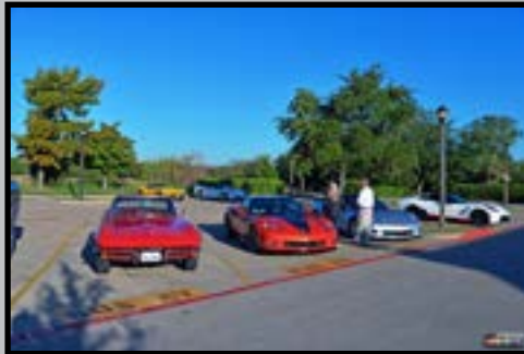
several met at Cracker Barrel to caravan

Cowtown had 21 Entries & 30 people participating 6 Supporters & 1 Visitor