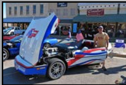
Shane with their C4 Convertible