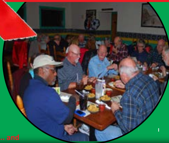
... and eating afterwards