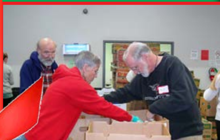
Members helping out at Tarrant Area Food Bank November 13th 2014