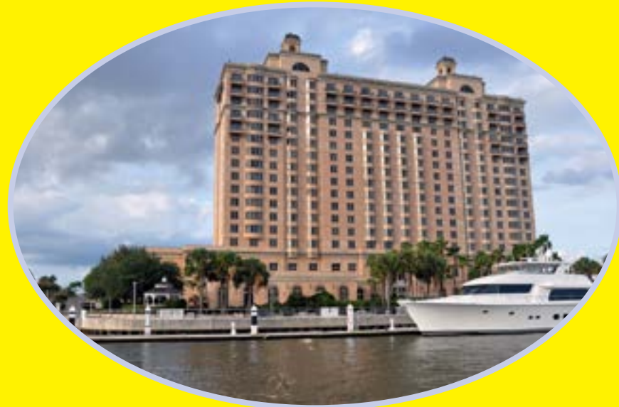
The Westin - Convention Host Hotel