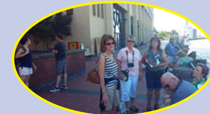
Waiting for the ferry