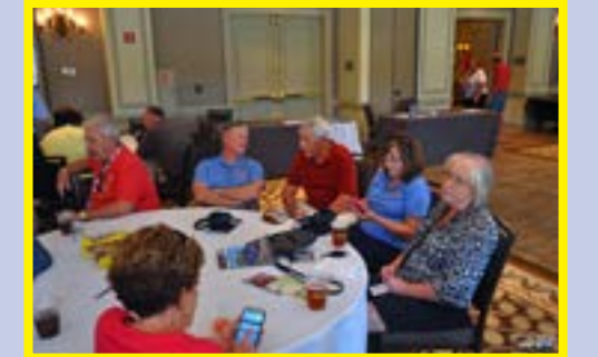
relaxing in hospitality