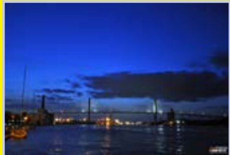
The bridge from Savannah to Hutchison Island