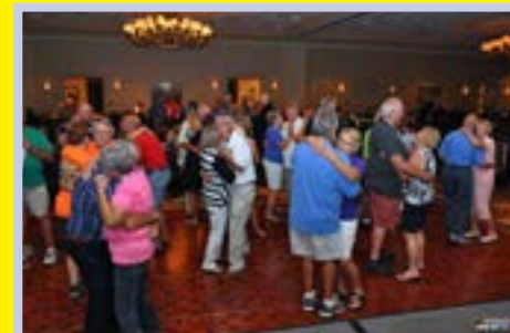
and of course, there is always music and dancing at Convention!