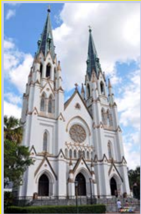
Cathedral of St. John the Baptist