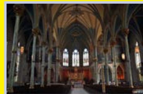
Inside the Cathedral