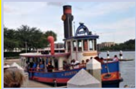
Our transportation to the mainland