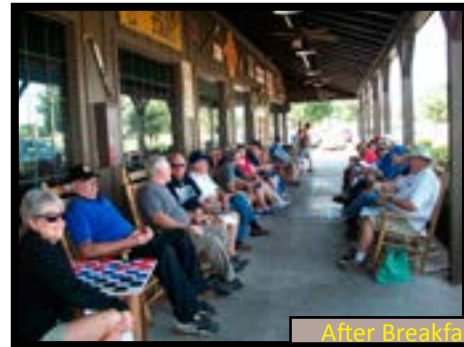
After Breakfast at Cracker Barrel