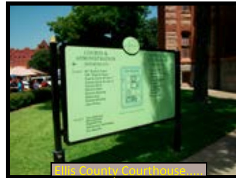
Ellis County Courthouse.....