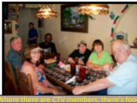
Where there are CTV members, there's food!