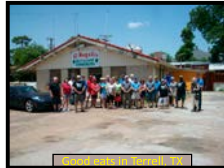
Good eats in Terrell, TX