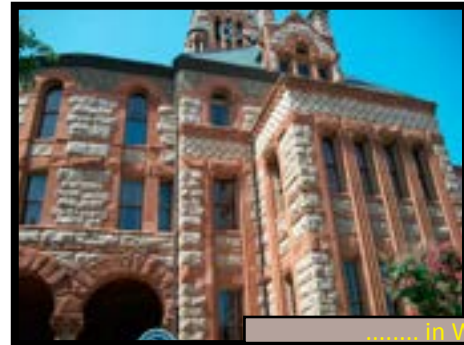
..... in Waxahachie, TX