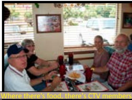
Where there's food, there's CTV members!