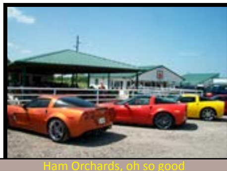
Ham Orchards, oh so good