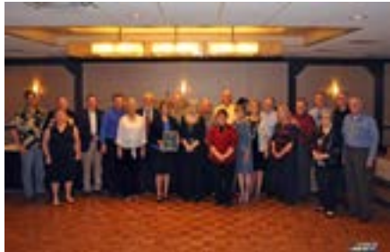
OCCC was the 2013 Top Competition Club

Flyers for these events can be found at http://ncccsregion.org/schedule.html