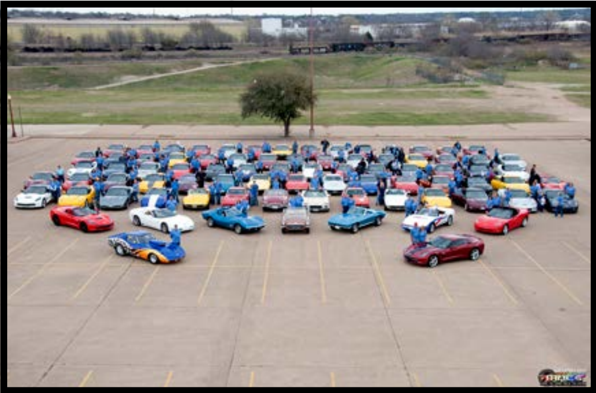
The Final Countdown!