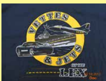
Vettes and Jets on the Lex "T" shirt