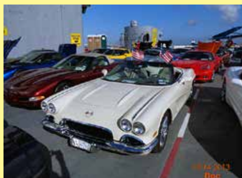
Ann ready for viewing; production unit #6