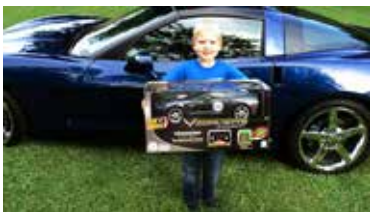
New FCOA member winner of Bright C7 Radio Controlled Corvette