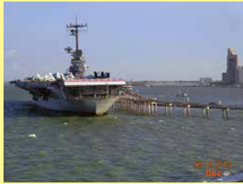
The USS Lexington at Corpus Christi – from motel