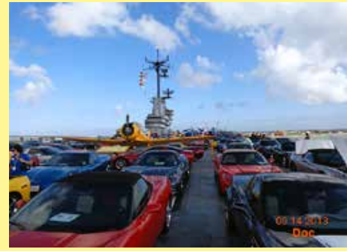
View from the front of the Lex – looking aft