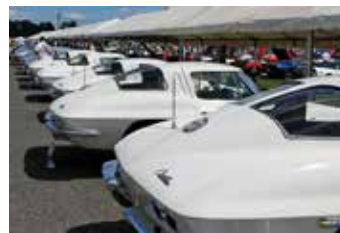
One special display of 63, 1963 Vettes (and that wasn't all of them)