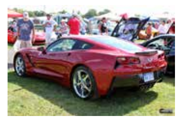
GM had over 18 2014 Vettes there - plus some mixed in with the general entries

The Cowtown Low-Down is published monthly for the members of Cowtown Vettes, and printed by LaserCopy Digital Production, Grand Prairie, Texas. All rights are reserved. All unauthorized reproduction of artwork, photos or articles, in whole or any part thereof, is prohibited. All unauthorized use violates state and federal laws.