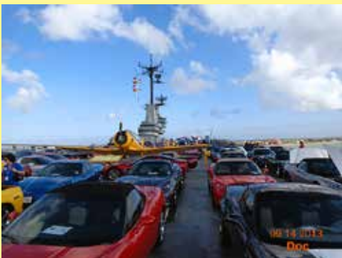
View from the front of the Lex – looking aft