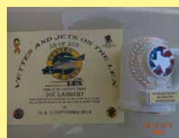
Certificate and Sponsor Award