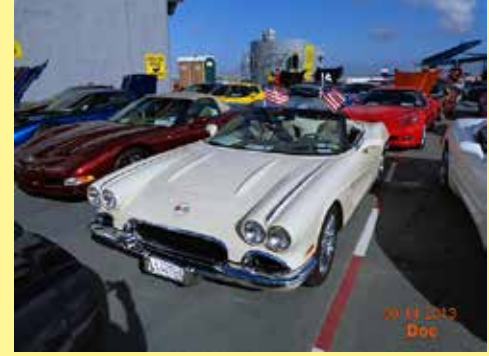
Ann ready for viewing; production unit #6 (May 2006)