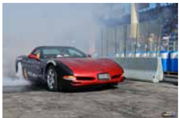
Wil Cooksey in the burnout contest