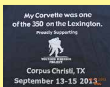
the back of the "T" shirt ...one of 350 on the Lex"