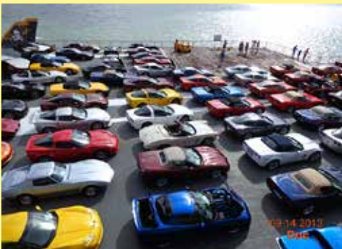
Vettes on the deck – Ann in the center with top down