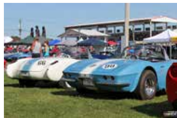
Lots of vintage racers