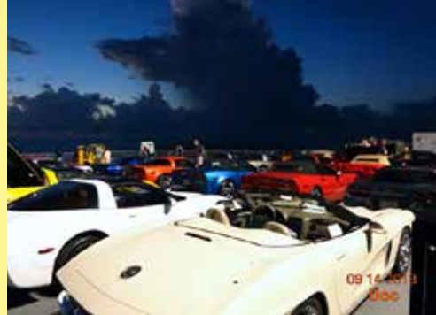
Ann parked on deck – look at the clouds