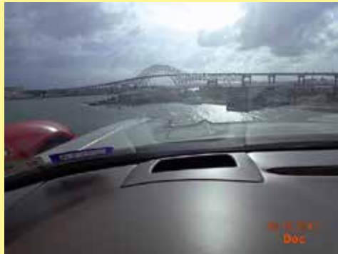
On the elevator – front row- no barrier-only 2 feet of deck ahead!