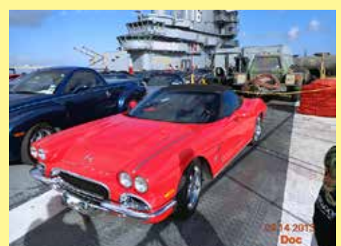
Another '62 CRC – red, from CO; production unit #5!