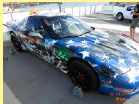
Maverick's (the MC) paint job