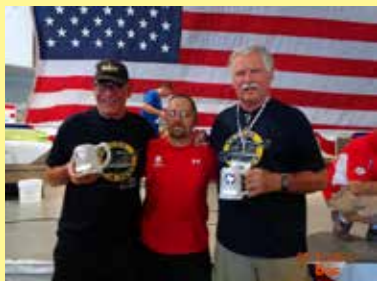
Two '62 CRCs won Sponsor Awards, with the MC "Maverick"