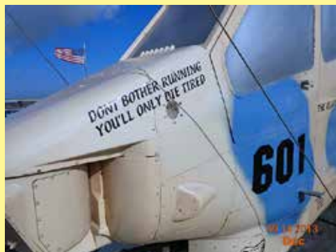
"Nose Art" on the Cobra