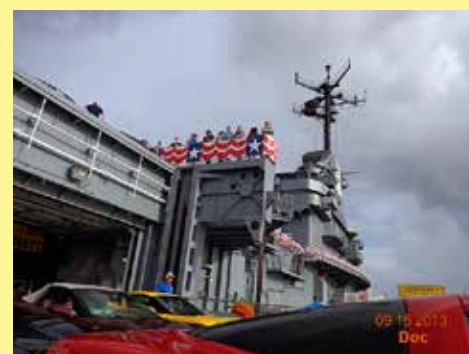
Safely down (looking back UP)