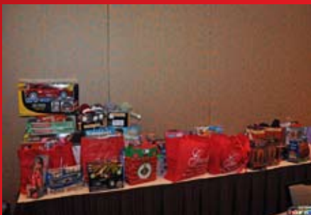
Toys to be donated to Mission Arlington