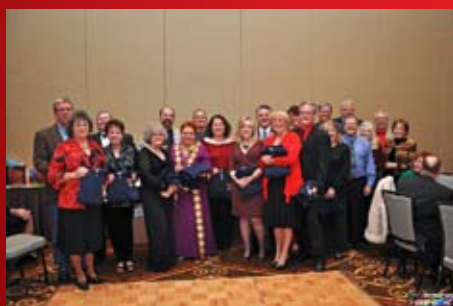
This group was 100% this year

CTV Annual Party and Awards Omni December