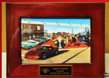
Carol's First Place Photo