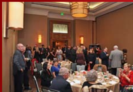
Pre-dinner Cocktail Hour