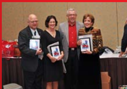
Gold Level Cruiser Participants