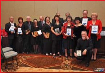
2011 NCCC Travel Award winners