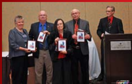
Silver Level Cruiser Participants