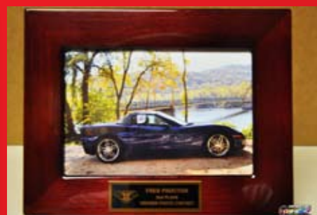
Fred's Second Place Photo