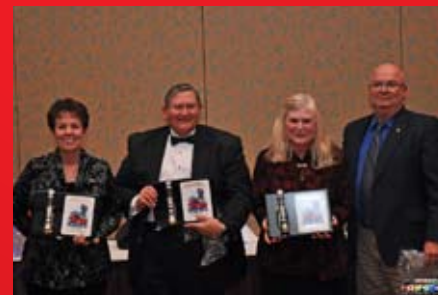
Top 3 Cruisers for the Year