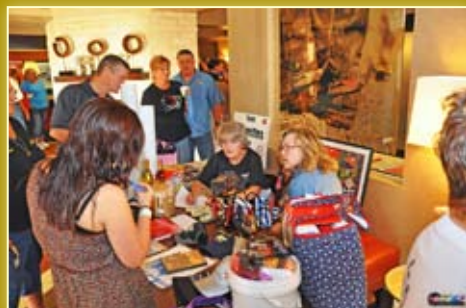
Raffle items for charity