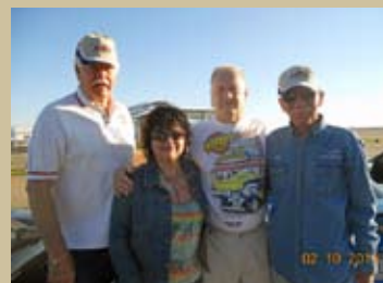
Our members at the NCCC Event