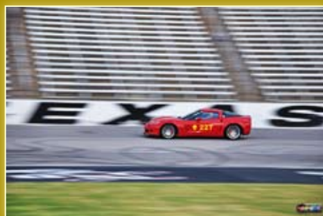
Lewis Crowder won the 5 lap Oval Drive raffle