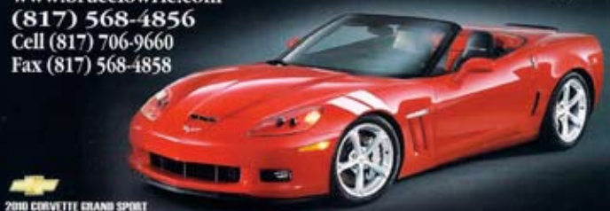
2010 CORVETTE GRAND SPORT

DID YOU KNOW? The Corvette was the first and last car with a true "wrap-around" windshield.