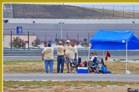
Corner Workers hard at work