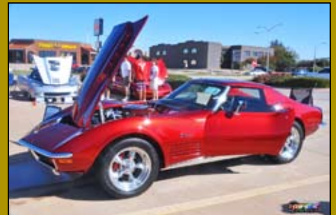
2011 Best of Show