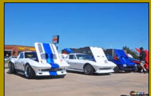
There were 3 C2 Grand Sport replicas in the Competition Class