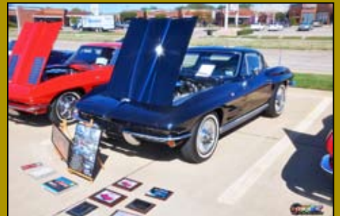
Hector Sandoval's '64 Blue Coupe