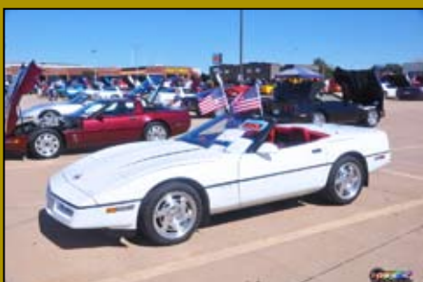
Fred Eichenberger's C4 convertible; 100K Class