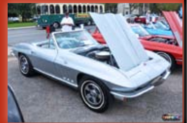
Rick's 66 Convertible