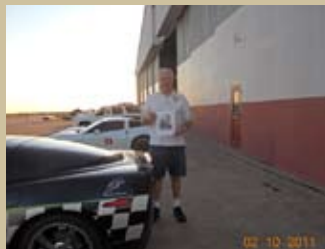
Doc capturing his CCP point