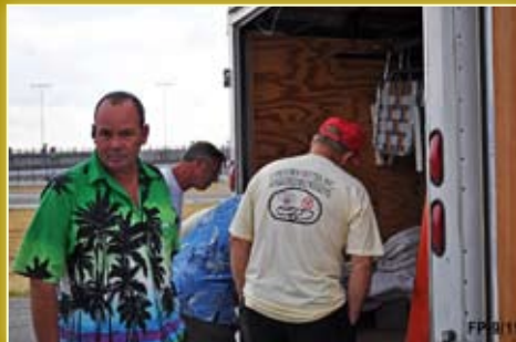
Setting up the course on Friday night (before the rain)