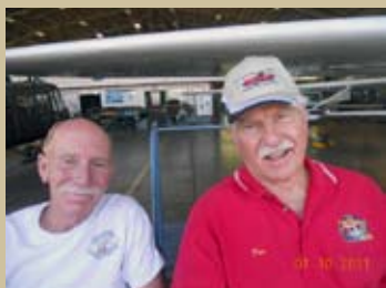
Red & Doc