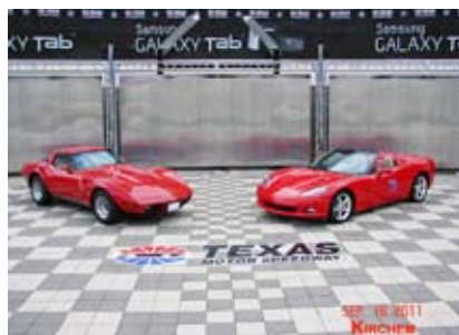
Kirchem & Eichenberger in Victory Lane