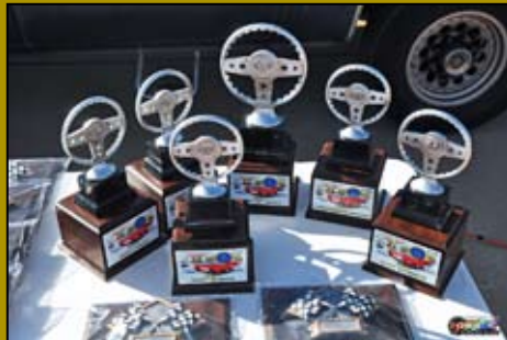
Great job with the designs of the Best Awards