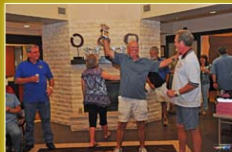
Saturday night awards time