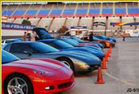
Lots of great looking Vettes