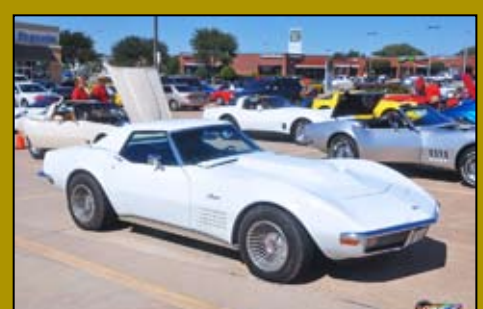
Carole Savage's '71 White Convertible