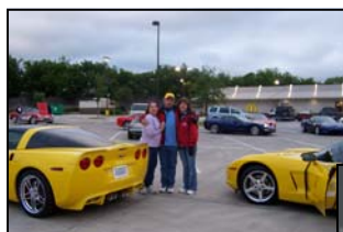
April 14 th Lone Star Corvette Club car show at Texas Motor Speedway

REMEMBER: whatever your Corvette interest is, pursue your passion, keep the spirit of fun and fellowship in mind ...and most of all... HAVE FUN DOING IT!!!