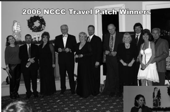
2006 NCCC Travel Patch Winners