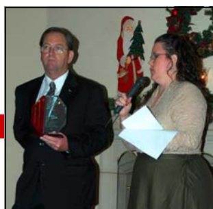
Bruce Lowrie Sponsor Award