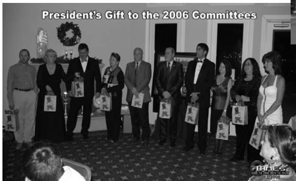
President's Gift to the 2006 Committees