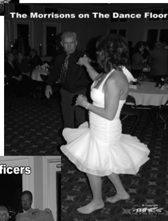
The Morrisons on The Dance Floor