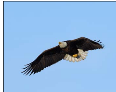
ACTUAL PHOTOS OF LLANO EAGLES