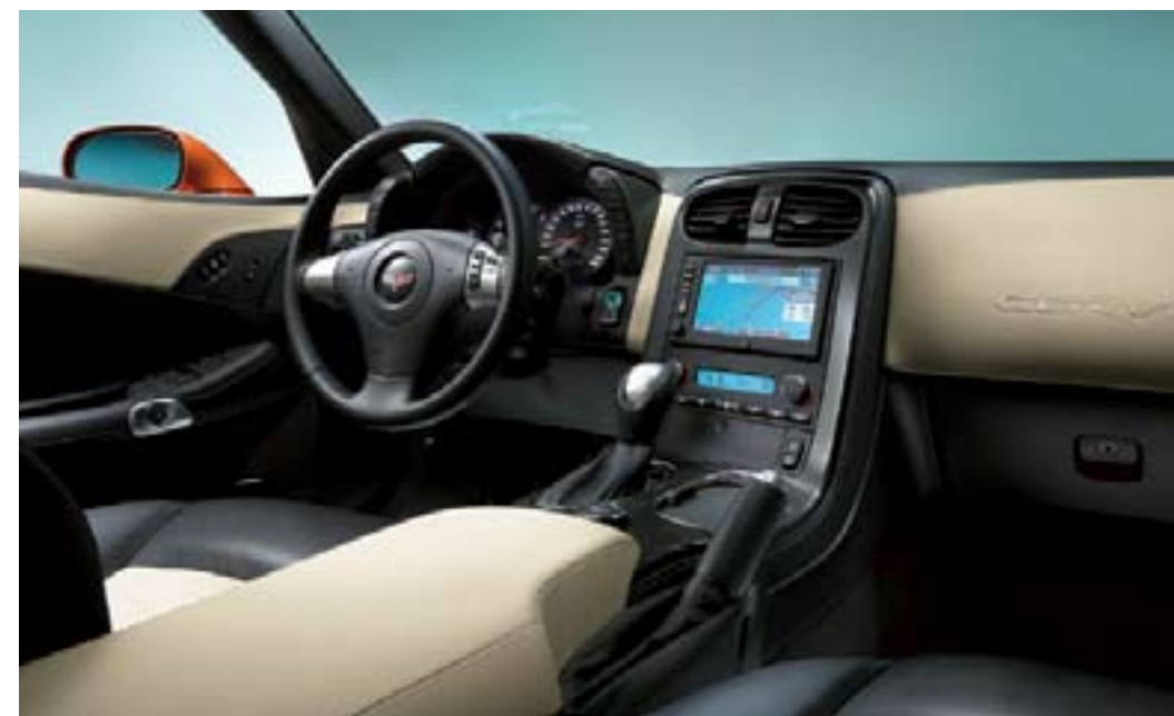
The available Custom Leather-Wrapped Interior Package includes two-tone seats, instrument panel, door panel uppers and console cover, all with contrasting stitching, plus an elegant Bias-pattern console trim plate. 4LT shown with available features.