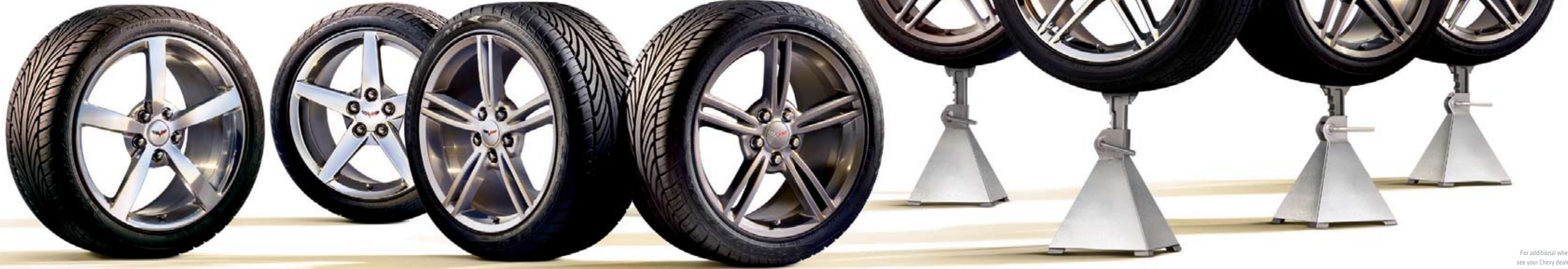
Available Z06 Polished Aluminum